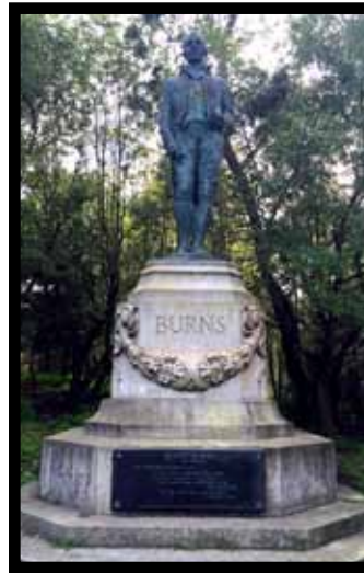
Statue of Robert Burns located in Golden Gate Park

My interest in the San Francisco Burns relates to my work on a manuscript for a book which is intended to provide an account of the often amazing stories behind each of the 50+ public statues of Burns across the world. This project