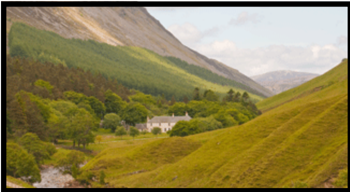
Forest Lodge on the Atholl Estate

Heritage and Archaeological Research Practice, Conference House, 152 Morrison Street, Edinburgh, EH3 8EB, Tel: 07856208076 email: harparchaeology@gmail.com web: www.harparchaeology.co.uk